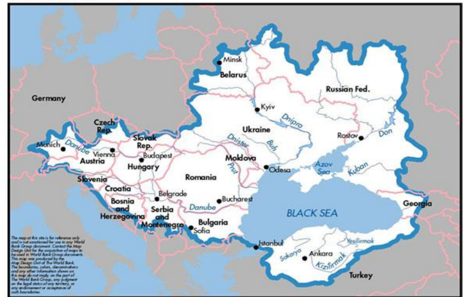
The Black Sea Basin